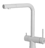
MGKT0U68 G68 8031873102890