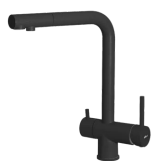
MKKT0U86 K86 8032557560814