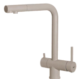
MGKTOU51 G51 8031873102883