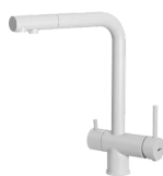
MKKT0U96 K96 8032557560821