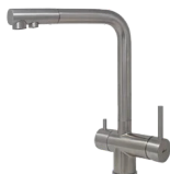
MIKTOUIN IN 8031873651374