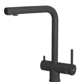
MGKT0U40 G40 8031873102876